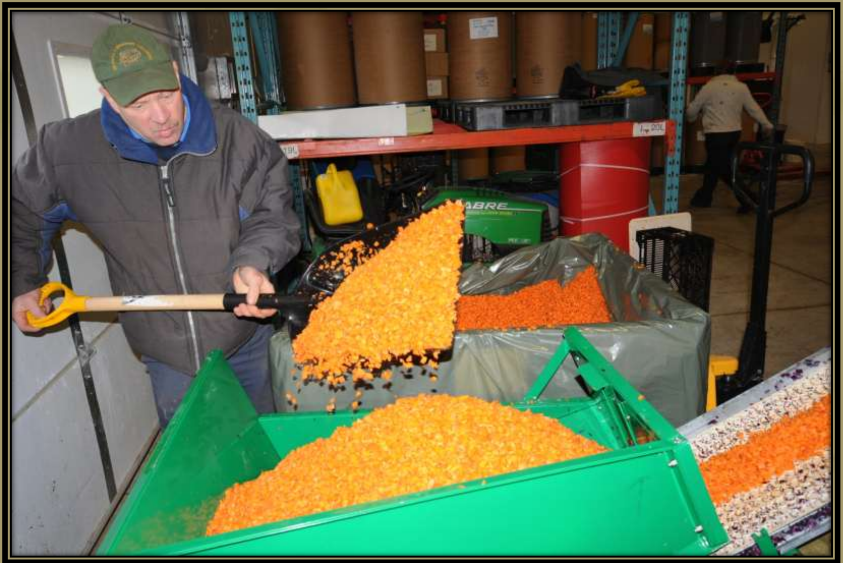
Loading the dryer with diced produce